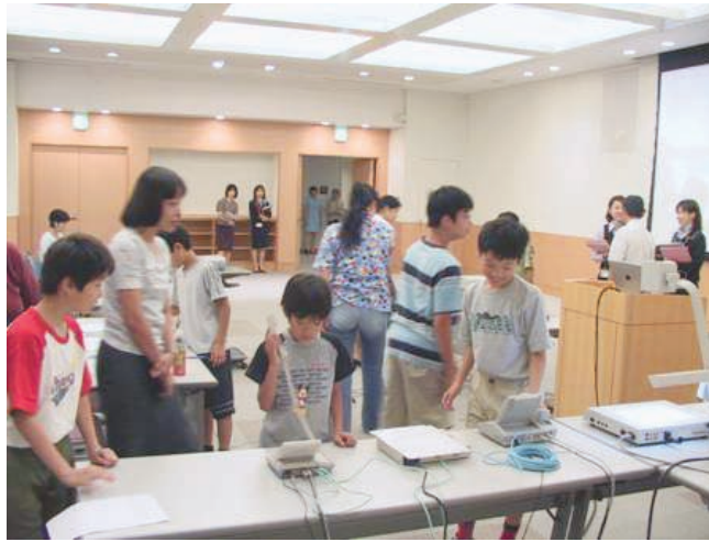
Photo 5. Exhibit hall.

The exhibit hall at the Musashino R&D Center brings together recent R&D achievements born of round-the-clock efforts at each of NTT's three laboratory groups. Here, visitors can touch and examine actual products and solutions (about 60 items) encompassing a wide range of advanced technologies enabling them to feel for themselves NTT Group's high level of expertise in developing technology and anticipating the needs of the times. The exhibit hall is normally open to just the NTT Group, but it also welcomes children, local residents, and other groups from time to time during events such as the Musashino Cherry Blossom Festival as part of our efforts to contribute to the community.