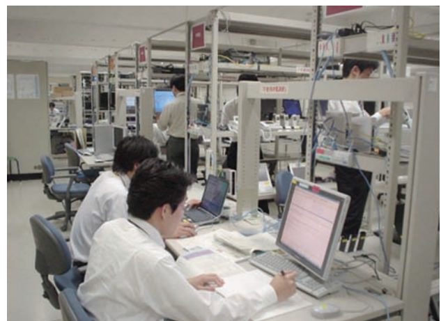
Photo 1. NGN testing activities.

In addition, NTT's efforts in the field of environmental information and communications technology (ICT) centered about the Environmental Management & Provisioning Project and the Energy and Environment Systems Laboratories are already beginning to produce results. One is the development of techniques for estimating macro-level reductions in energy consumption achieved by applying ICT. This achievement was cited in an environmental white paper issued by the Ministry of the Environment in 2006, which is something that we take great pride