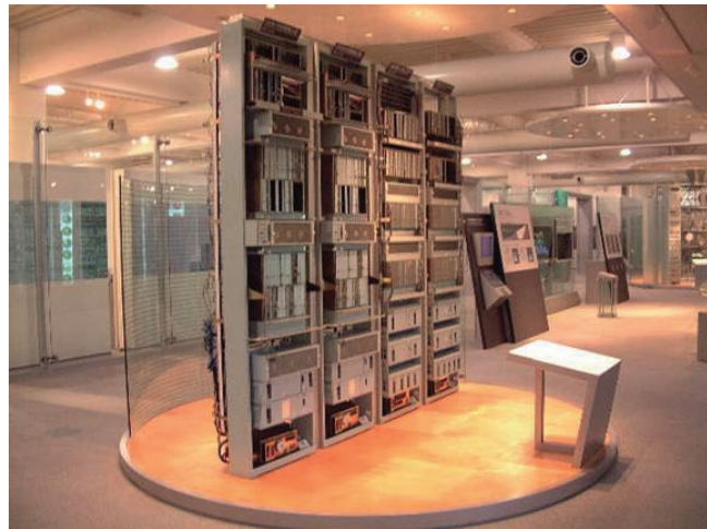
Photos 2, 3, and 4. NTT Telecommunication History Museum.

Focusing on the first half-century since the founding of Nippon Telegraph and Telephone Public Corporation, this museum presents the historical assets behind technology development in the NTT Group. Although not a public museum per se, its exhibits—which provide a systematic overview of the history of telecommunications technology in Japan—have received high praise from a wide range of visitors that include not only NTT Group employees but also customers of NTT Group companies, representatives of educational institutions, and local residents. The museum is open to the general public once a year during the Musashino Cherry Blossom Festival when the Musashino R&D Center also opens its grounds for cherry blossom viewing. On this day, the museum receives about 1000 visitors. In recent years, the museum has been increasingly used as part of the training for new employees of the various NTT Group companies.