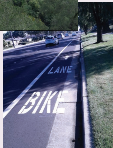
Many roads in Silicon Valley have bike lanes.