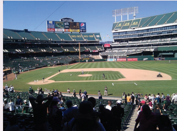
MLB team Oakland Athletics.

We are trying to follow the Silicon Valley way of having fun on weekends by doing sports to get refreshed and energized.