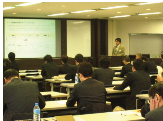
Private seminar that we held in Japan at the beginning of 2011.