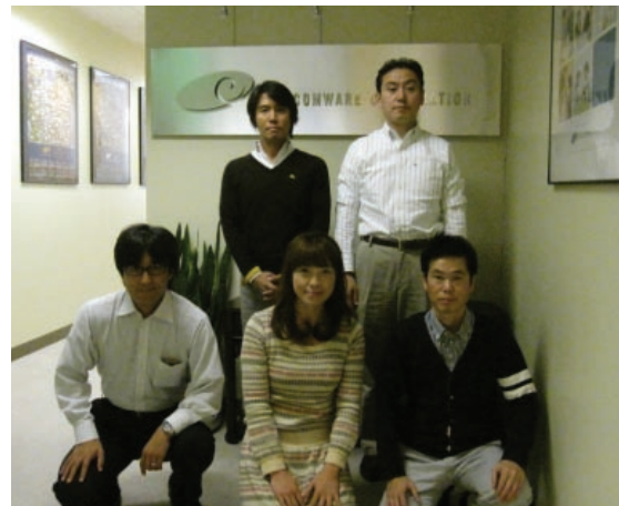
Photo 1. Staff members of NTT COMWARE America Branch.

Several remarkable high-tech companies like