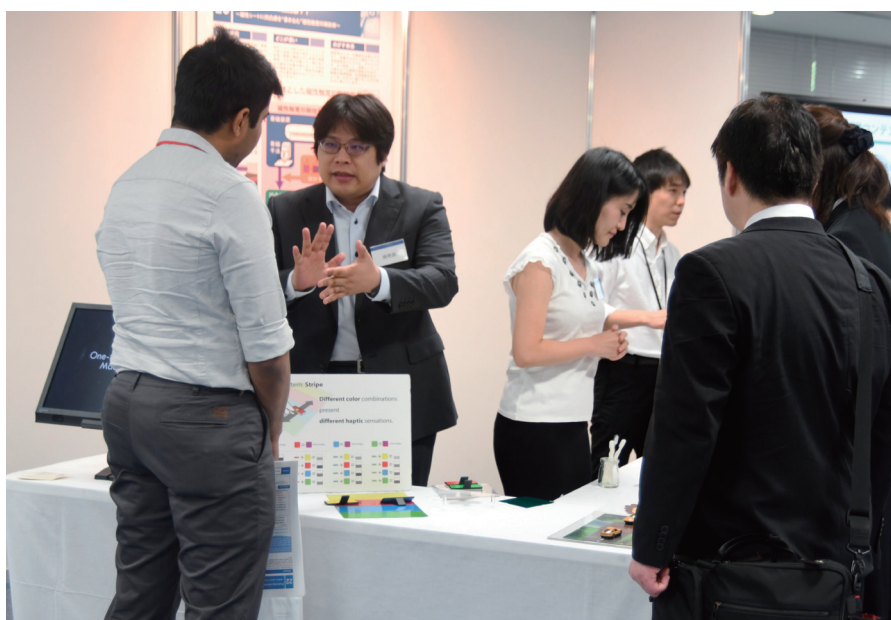
Photo 7. Researchers explaining a demonstration.