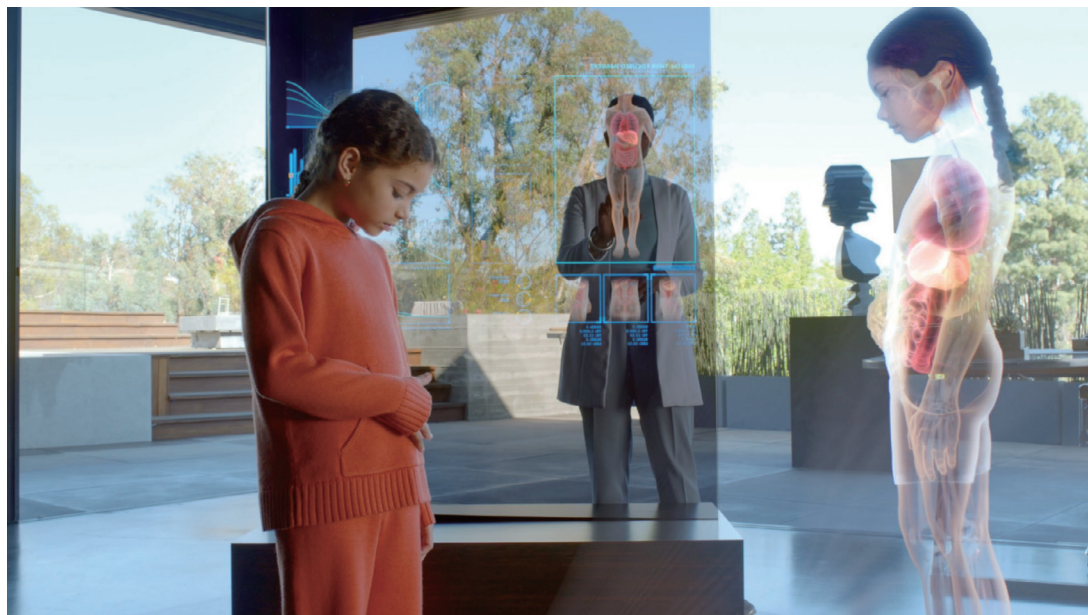
Fig. 1. Schematic of bio-digital twin (BDT).